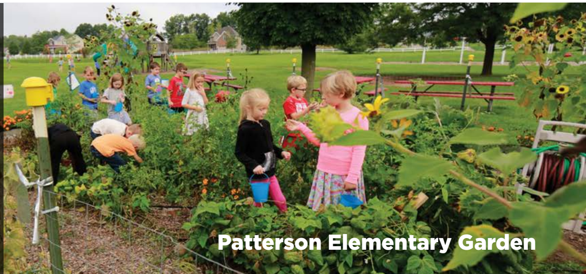
Patterson Elementary Garden

This fall, Patterson Elementary students harvested tomatoes, zucchini, flowers and other produce in their very own garden! Students planted the garden adjacent to the school’s playground as part of an ongoing, hands-on science learning opportunity. Throughout the summer, students continued to weed and water the garden.