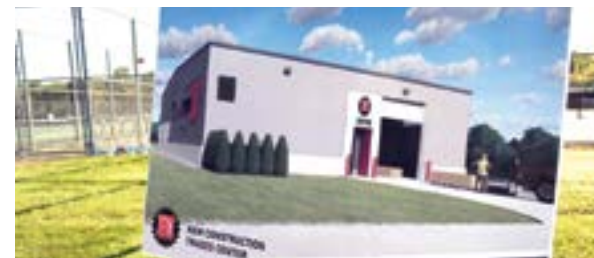
Schematic of new Construction Trades Center at the groundbreaking event.