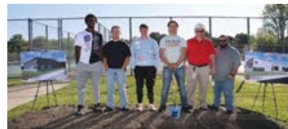
Holly Area Schools construction trades students take their turn at the shovel at the Construction Trades Center groundbreaking.