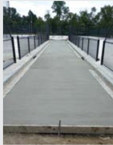
Holly Tennis Courts sidewalks