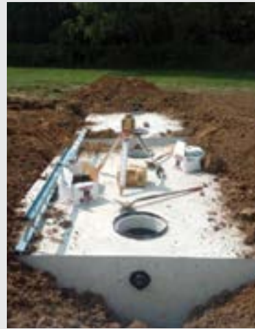
Davisburg Elementary septic tank installation