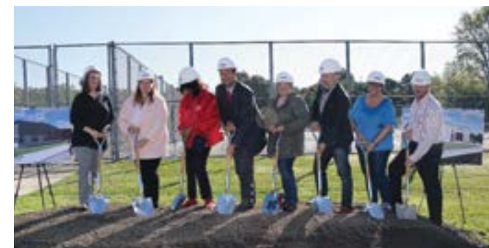
Holly Area Schools administrators, staff and school board members at the groundbreaking of the state-of-the-art Construction Trades Center.

at the groundbreaking event outside Holly High School. "Our Construction Trades Center is made possible by the generosity of our Broncho community, and is further proof that it's a great time to be a Broncho."