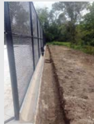
Holly Tennis Courts fence installation