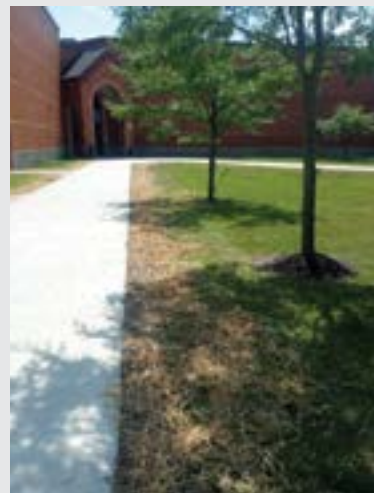
Holly High School site restoration