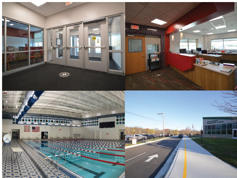
Summer 2020 bond projects included installation of safe and secure entryways, traffic improvements, and front office upgrades at Davisburg and Rose Pioneer elementary schools, pool improvements at Holly High School, and much more.

Last summer's projects included installation of safe and secure entryways, traffic improvements, lighting, heating and cooling improvements, and front office upgrades at Davisburg and Rose Pioneer elementary schools; media center relocation at Rose Pioneer Elementary School; and pool improvements at Holly High School.