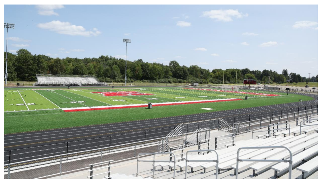
Upgraded Holly High School track and athletic turf field