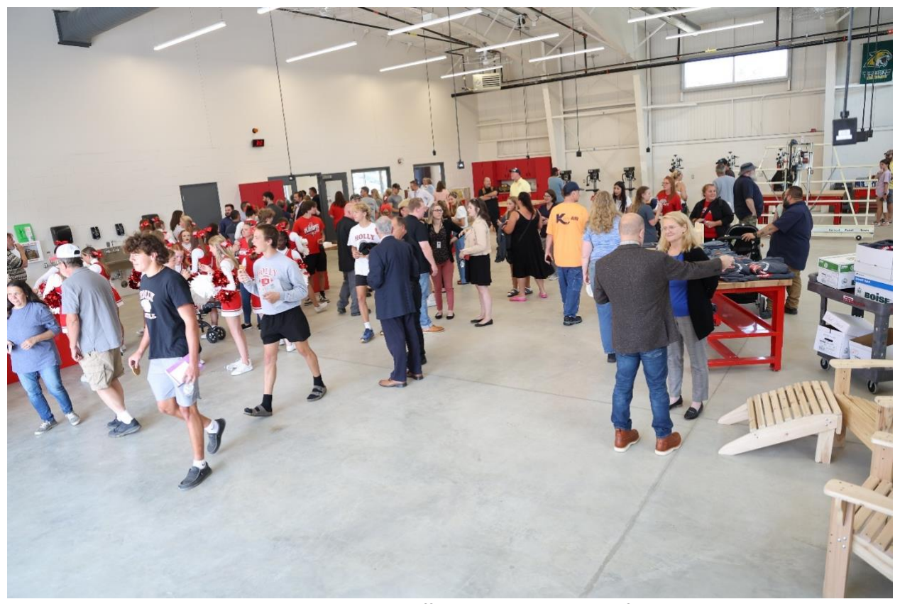
Holly Area Schools students, board members and staff celebrate the opening of the new Holly High School Construction Trades Center.